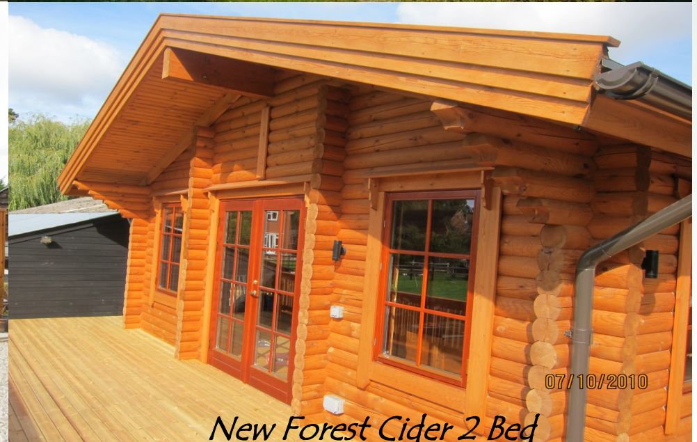
New Forest Cider 2 Bed