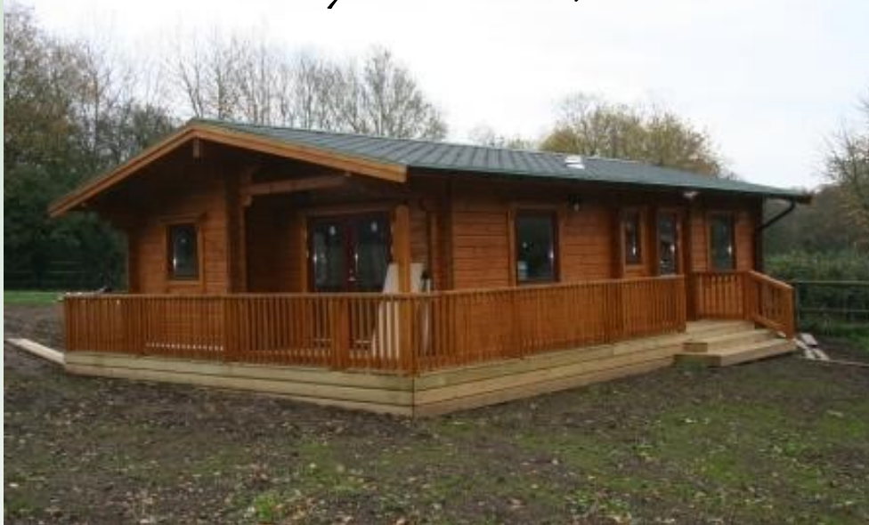
Wycombe 2 Bed