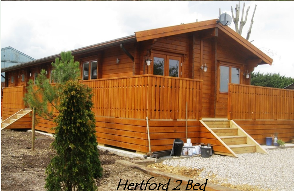
Hertford 2 Bed