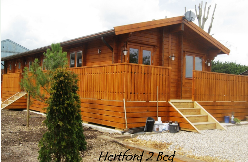
Hertford 2 Bed