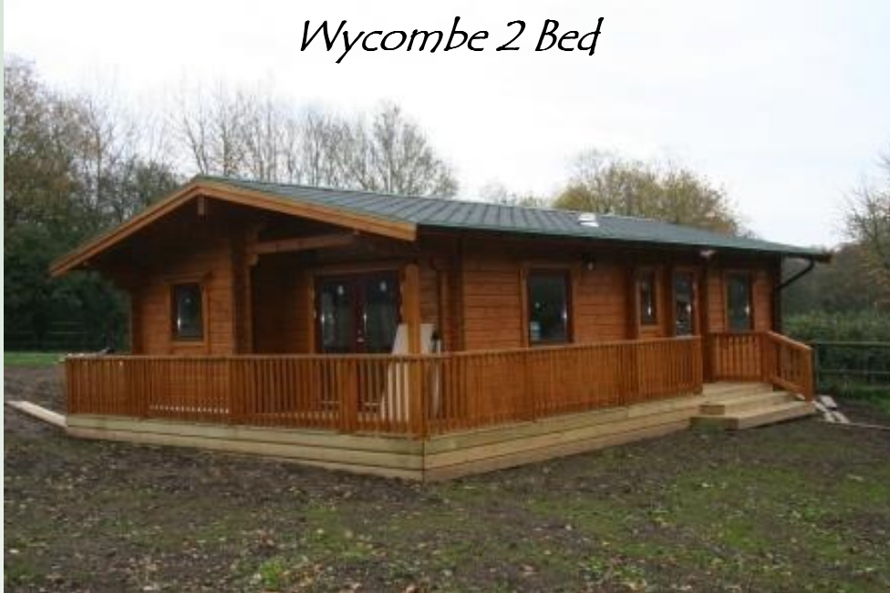
Wycombe 2 Bed