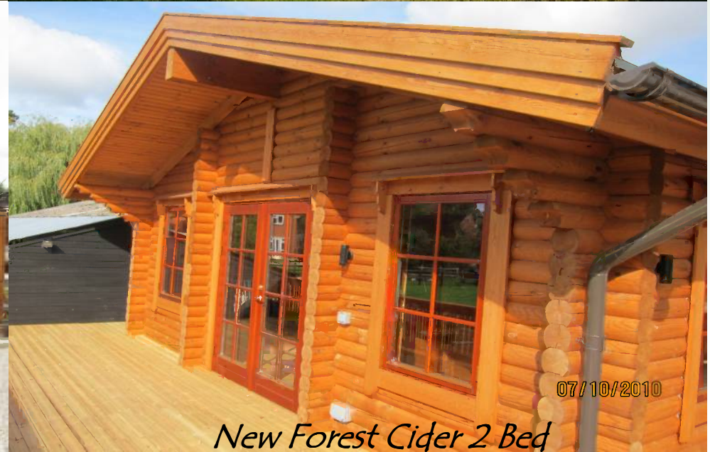
New Forest Cider 2 Bed