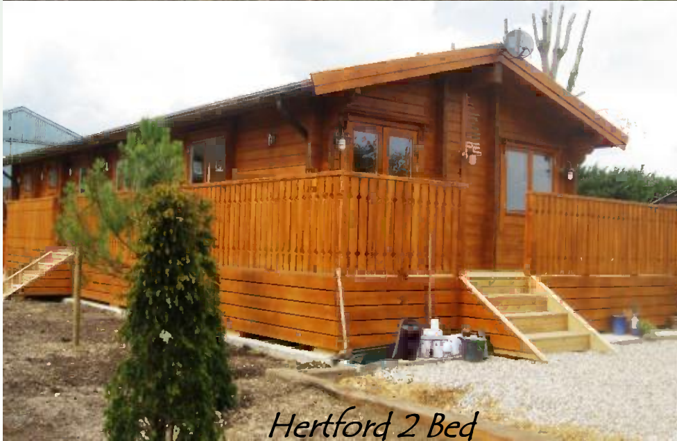
Hertford 2 Bed